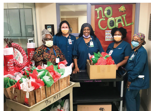
Auxiliary members distributed gifts of appreciation to Respiratory Therapists at Methodist University Hospital

While the Auxiliary members were unable to volunteer in the hospitals in 2021 due to visitor limitations, the volunteer group instead spent their time