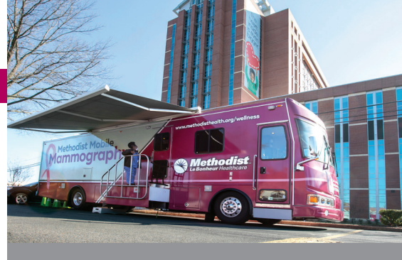
Methodist Mobile Mammography Bus provides free breast health services to those in need.

A gift of appreciated stock is a meaningful way to provide significant