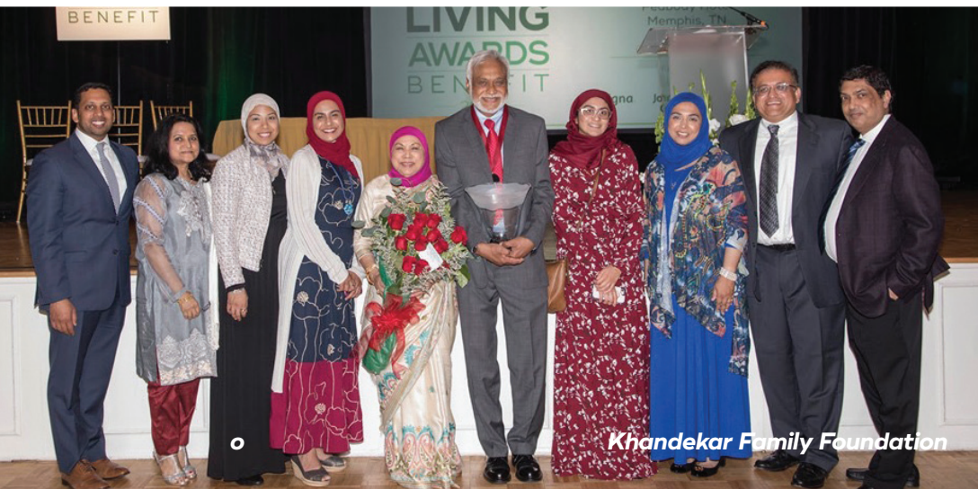
Khandekar Family Foundation